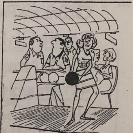
"The toughest part about bowling with our wives is trying to keep a straight face for three games!"

A copy of the final average sheet MUST be sent to the Area Association Secretary