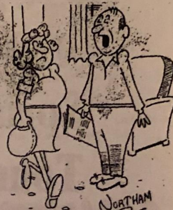
"Another X-rated bowling score, dear?"

ABC BOWL DAGENHAM: 20th Feb. S.E.B.A. & ABC present NORMA BRIDGE MEMORIAL TROPHY (2nd Yr) 5 games. Sc.Sgles ABC BOWL BEXLEYHEATH: EVERY SAT. 12.30 & 3.30 p.m. LANGS WHISKY OPEN DOUBLES: Total entry fee only 61p.