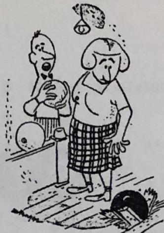
"Ball too heavy, dear?"

The first tournament for SEBA members in 1971 will be the annual '600 Club'. Full details and entry form in next month's 'Bowling News'.