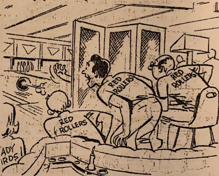
"He claims it's the only way he can concentrate."