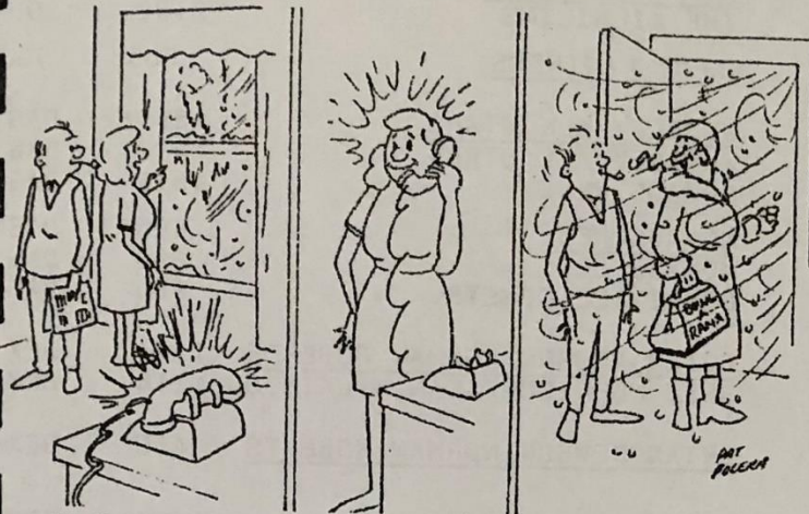
"You'd never get me out on a night like this!"