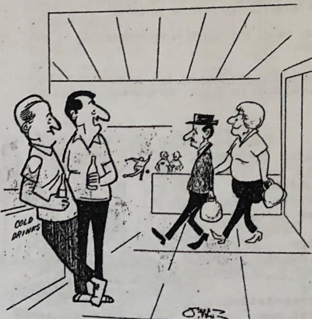
"Here comes Fred with the old 'handicap.'"

BOWLER: "No, but thanks for the compliment!"