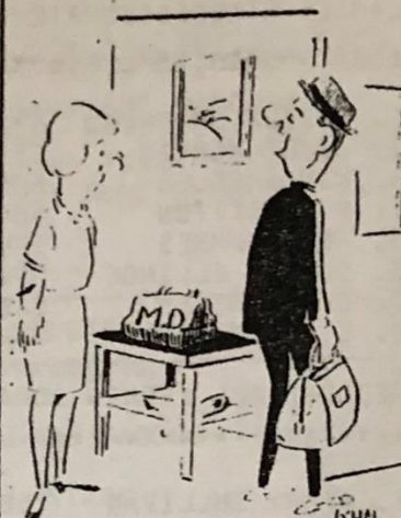
"I am going to see a patient. He's my bowling partner."

It must be gratifying to all sportsmen that in a truly world-wide activity so much of the vital impulse still derives from British talent.