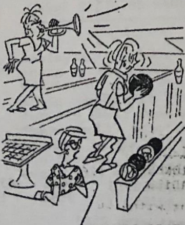
"Oh, don't let her playing taps bother you!"

Following in the wake of the Nationals comes our own 6th Annual Area Championships and without doubt this will be the biggest event yet held in this area. Bowlers from Cliftonville, Southend, Basildon, Harlow, Hoddesdon, Chatham, Whitstable will travel to Bexleyheath over the first weekend in May to join the home keglers to make this possibly the largest event yet held in the South East. The number of early entries has been quite phenomenal and the most popular squad times were already filled only a week following issuance of the entry forms. From the opening squad at 7.30p.m. held in conjunction with our traditional opening ceremony there will be no let up until the curtains come down for another year at approximately 11p.m. on Sunday night.