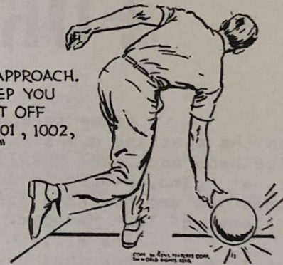
Copyright © 1967 by Dick Weber, Inc. All rights reserved.

TIME YOUR APPROACH. ON EACH STEP YOU TAKE, COUNT OFF SLOWLY: "1001, 1002, 1003, 1004."