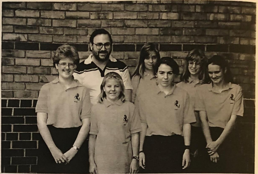
Kent's Girls Junior Teams for 1992 with their coach taken at this year's County Finals