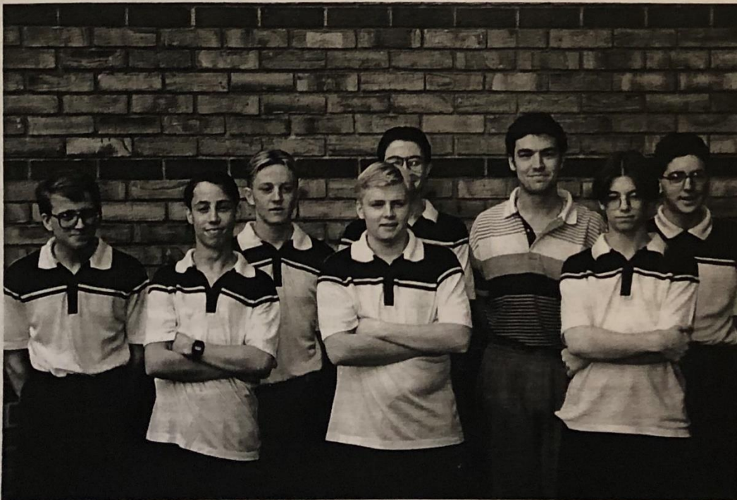
Kent's Boys Junior Teams for 1992 with their coach taken at this year's County Finals

As this is our last issue before Christmas, I would like to thank all those who have helped with the production of Bowling News during the year, and to wish all bowlers, wherever you may be, a VERY HAPPY CHRISTMAS and a GOOD BOWLING NEW YEAR.