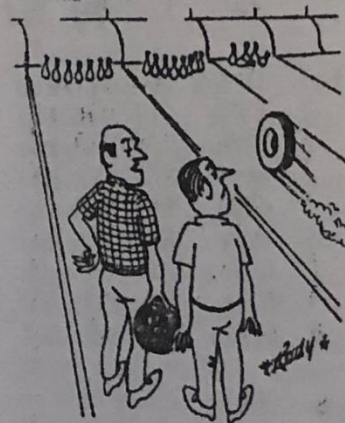
"Well, it looks like a spare to me..."

A final count of 166 British bowlers have signed for a two week tour of New England next July. Based in Hartford, Conn., the group will play ten challenge matches in the area in the evenings after touring the countryside during the day. Local proprietors and bowling associations are arranging for some professional bowlers to be on hand to give instructional clinics and assist the group with the choice of new equipment.