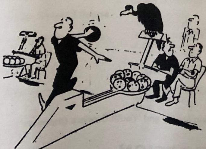
"The man is throwing a deaf ball tonight."