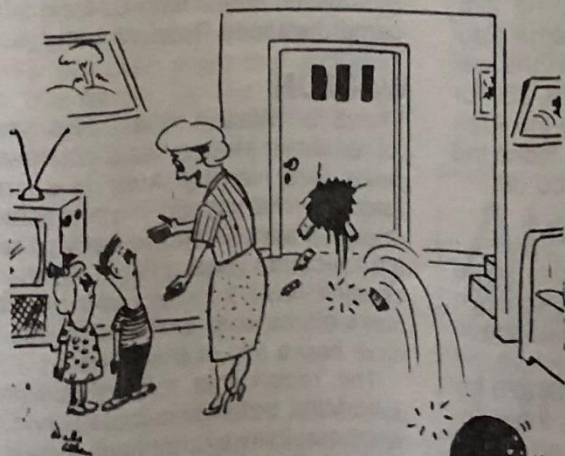
"You children better run upstairs to bed, daddy had a bad score in the tournament."

To all the faithful, keep up the good work. Elect a League Delegate for next year's SEBA AGM in February. Support one of the best Local Associations in the country, THE SOUTH EAST BOWLING ASSOCIATION. Better known as SEBA. This publication comes courtesy of the 3p you pay each time you bowl. I make no bones of the fact that we do have a few leagues at Basildon, Southend and Whitstable that do not support the Area Association funds, and they are denied the pleasure of belonging and taking full part in our activities. But enough of them. Thank you for your support during this last season. may our Area continue to be the BEST.