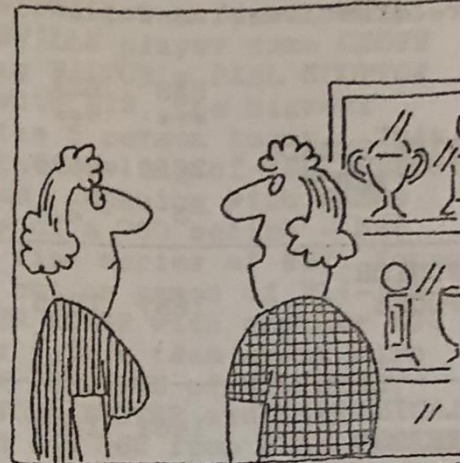
"THESE ARE DAVE'S BOWLING TROPHIES ... BOOBY PRIZE, LOWEST AVERAGE WORST GAME, MOST GUTTER BALLS."